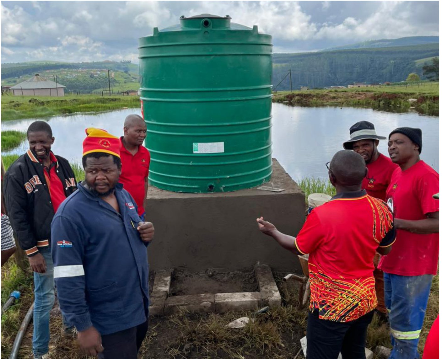
The People's Red Caravan restores the provision of safe and drinkable water in Zamafuthi Village