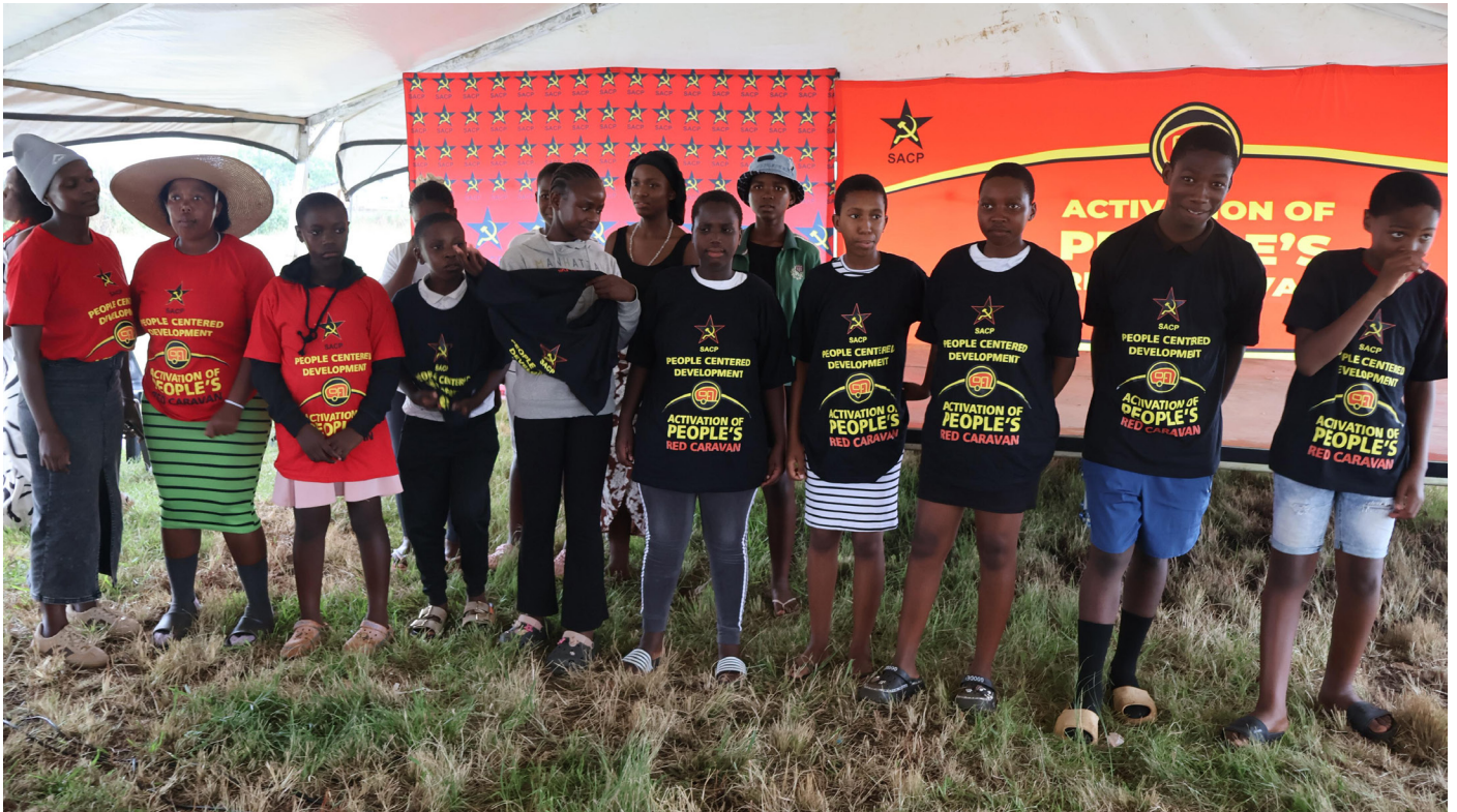
Hlokozi at Ixopo showed what true activation looks like: people mobilising, energised, and determined to do things for themselves.