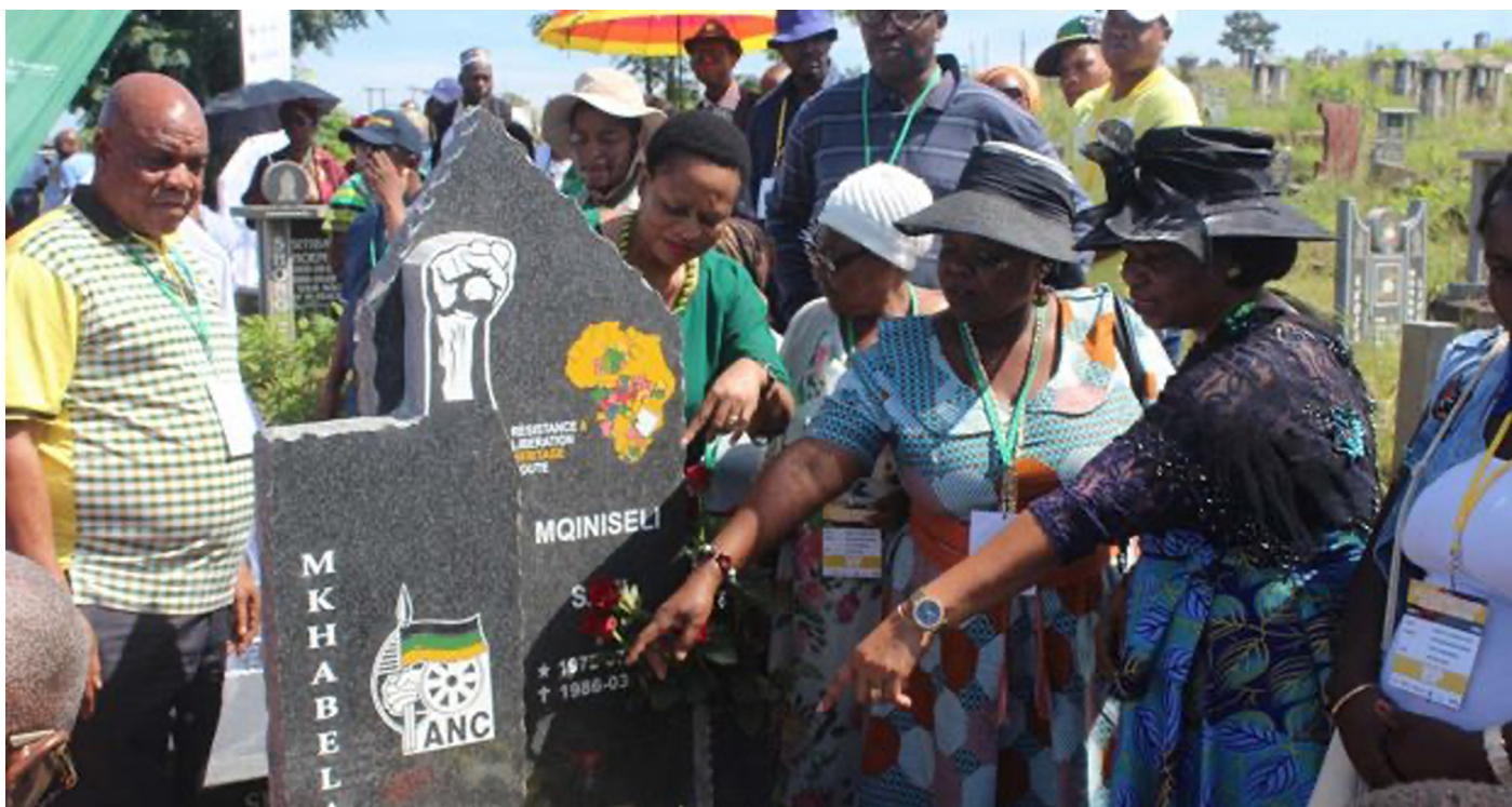
Wreath laying at the graves of the Lowveld Massacre victims in 2018