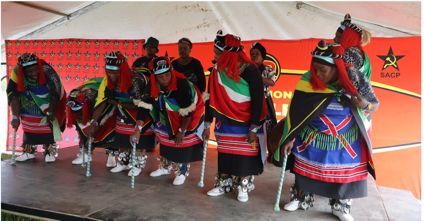
Songs of struggle, poetry of resistance, and dances of solidarity echoed through Hlokozi.