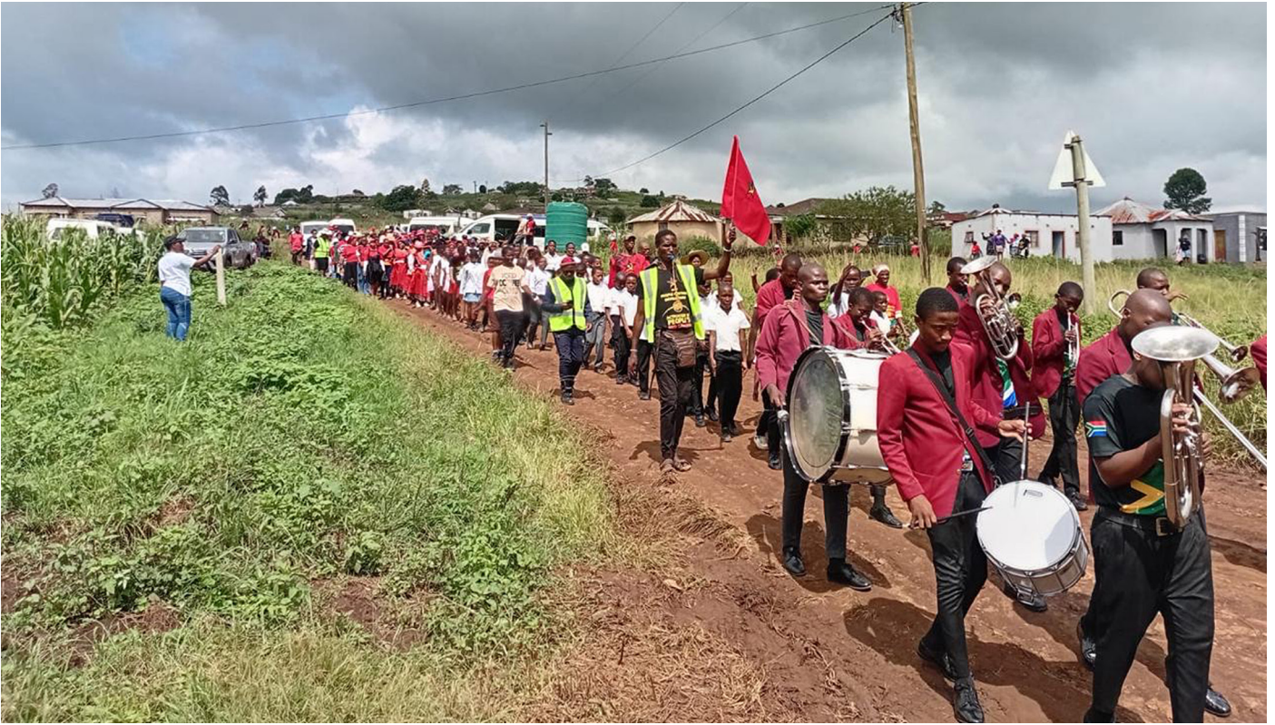
The Hlokozi PRC ended with a march of about 160 people, including children, behind a brass band performing the Internationale before the final handover meeting, 22 February.