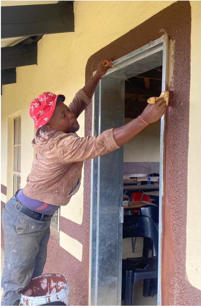
The Hlokozi PRC carried out renovation work on Luswazi Secondary School to improve conditions for learners.

“The PRC in Hlokozi, Ixopo stands as a beacon of hope and determination.”