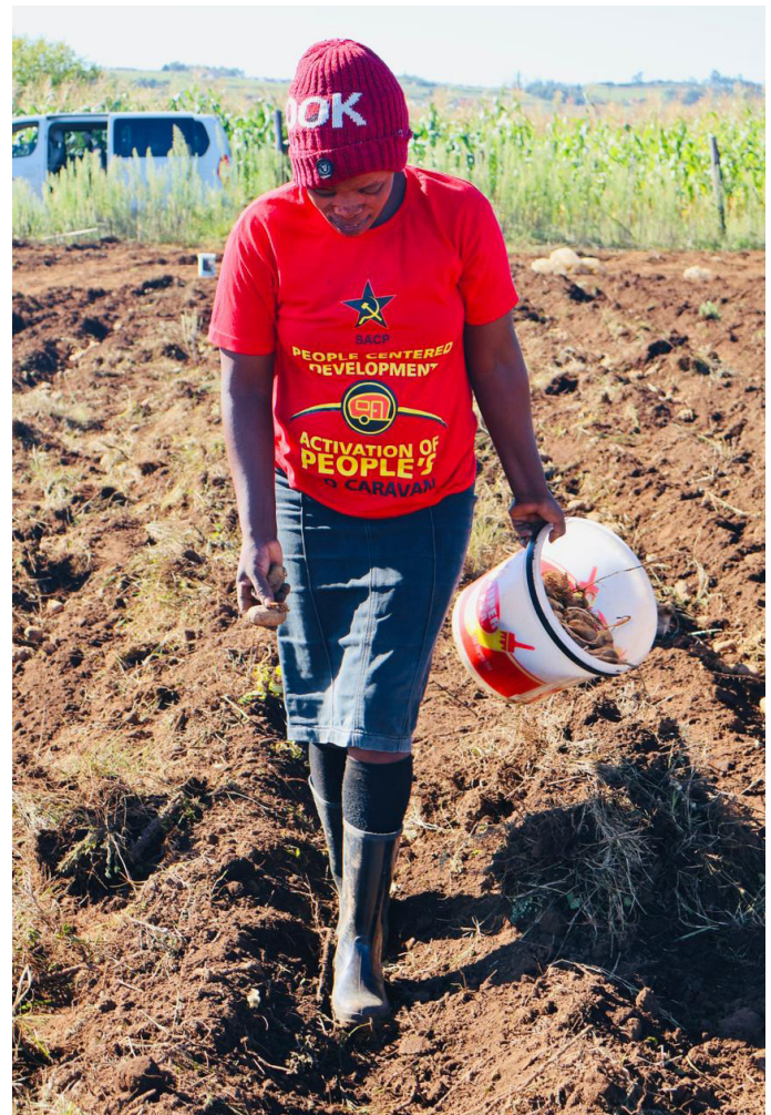
Food security: the PRC prioritises creating and expanding community food gardens.

The intervention strengthens community-based