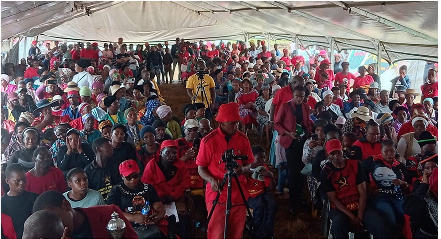
Hand-over and report-back meeting in Hlokozi, Zamafuthi Village, KwaZulu-Natal, PRC.

There is a moment in this issue that says everything about what the South African Communist Party is and what it must become.