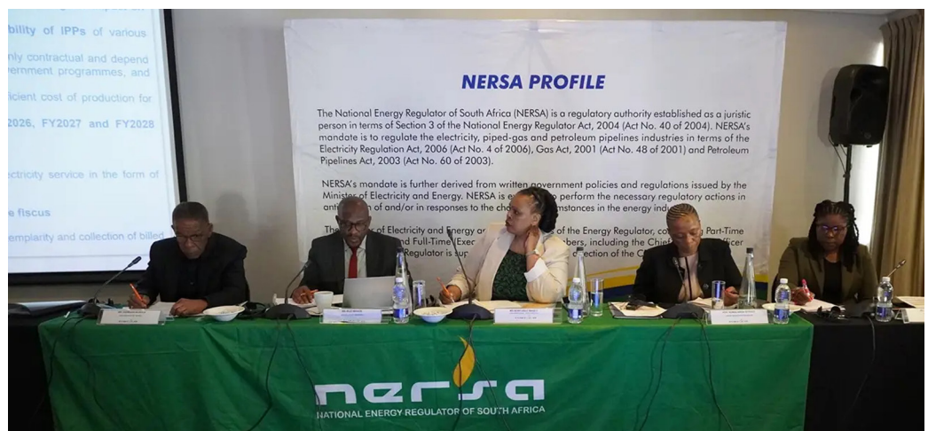
Not on our side: Nersa has approved Eskom’s recovery of an additional R54.7 billion in “allowable revenue” over the next two financial years.

“A few years back our electricity was around